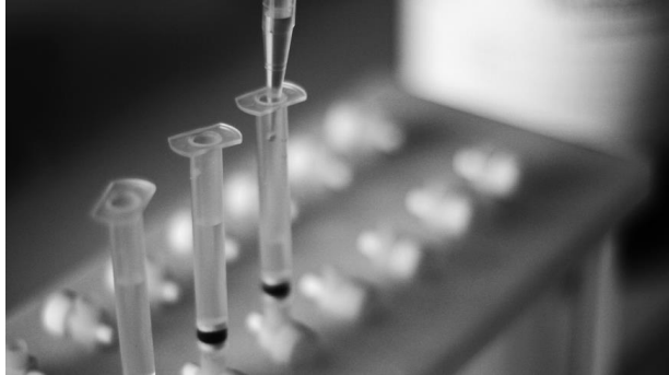
Wash the cartridge with the following: