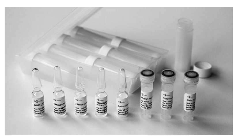
Each kit contains one vial of each of the following: